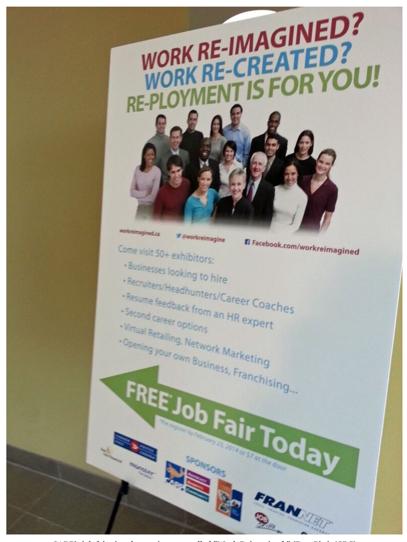
CARP's job fair aimed at seniors was called "Work Reimagined."